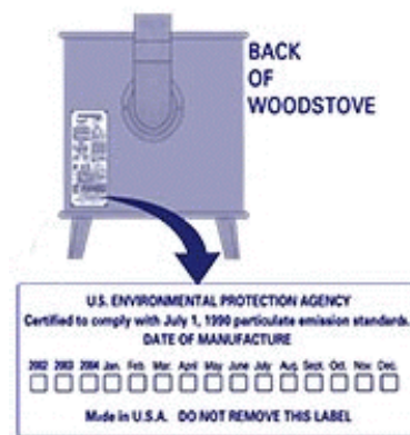
Permanent Wood Stove Label affixed to a stove