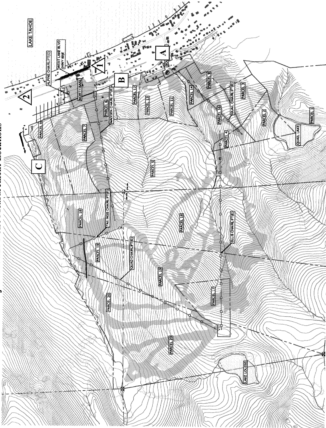
Figure 1 Homewood Mountain Resort Project Site and Noise Measurement Locations