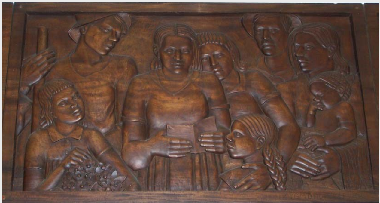
Center Panel of The Letter

Used with the permission of the United States Postal Service®. All rights reserved.