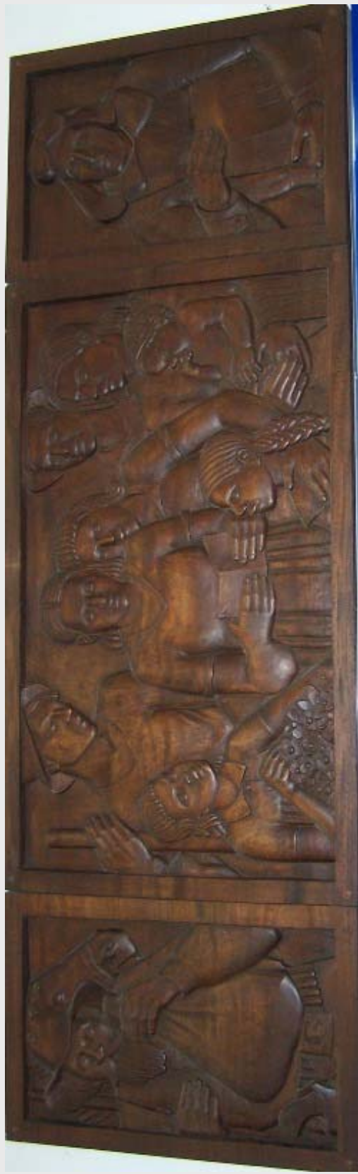
The Letter Zygmund Szevich 1936