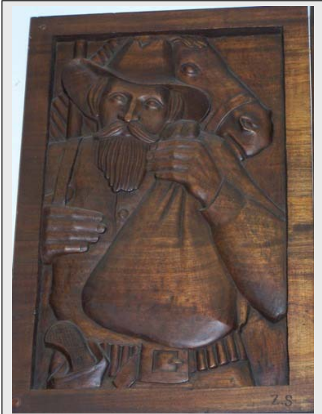
Left Panel of The Letter

Used with the permission of the United States Postal Service®. All rights reserved.