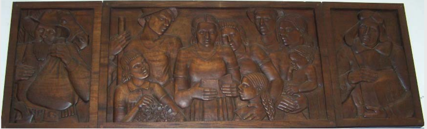
The Letter Zygmund Szevich 1936

Used with the permission of the United States Postal Service®. All rights reserved.