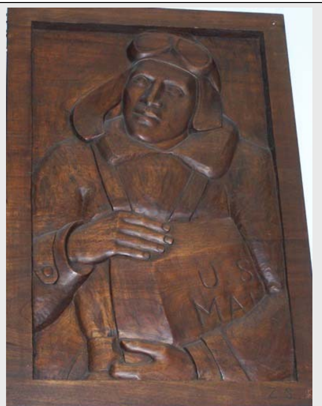
Right Panel of The Letter

Used with the permission of the United States Postal Service®. All rights reserved.