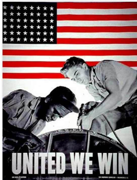
Poster printed for the War Manpower Commission c. 1943