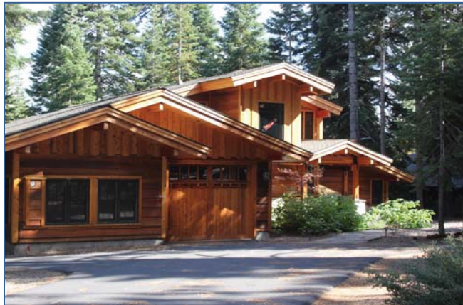
A new single family house

Upon adoption of the 1987 Regional Plan, new subdivisions were prohibited and each vacant residential parcel was assigned one residential development right. To build a home, a property owner must have a development right, a “buildable” IPES number and a residential allocation. Alternatively, multi-family units can be created in appropriately zoned areas by completing certain environmental enhancements and obtaining a multi-residential bonus unit from TRPA. In February 2015, there were 1,094 vacant residential parcels (development rights) in the Plan area.