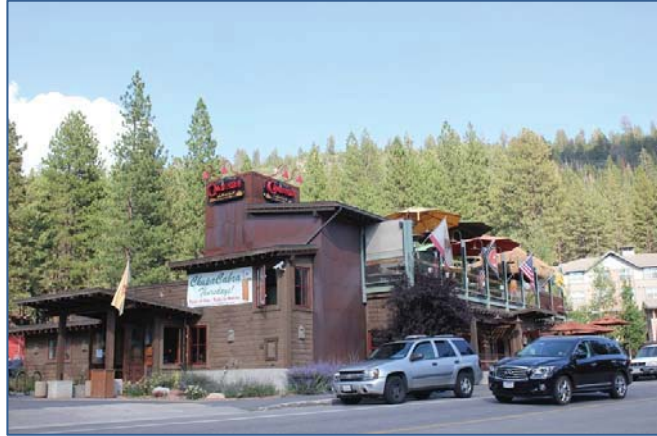
Kings Beach Town Center

Tahoe City has seen a little more private redevelopment than Kings Beach, although most private development remains largely unchanged from the pre-TRPA period. The golf course was recently acquired by Placer County and partner agencies and provides an opportunity to support community enhancements.