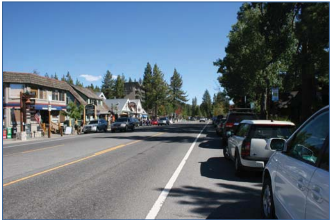
Tahoe City Town Center