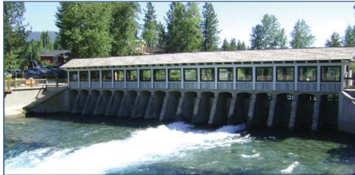
Lake Tahoe's dam and outlet in Tahoe City

This Land Use Plan is intended to restore the environment, enhance community character, and improve socio-economic conditions. Development will be managed in accordance with the Regional Plan and the environmental Threshold standards.