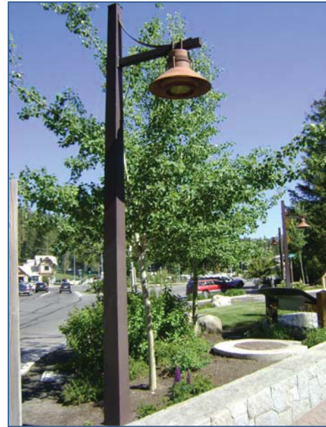
Recent improvements in the Kings Beach Town Center

The Town Center of North Stateline includes a relatively small area that adjoins and is integrated with larger Town Center properties on the Nevada side of the state line. The Area Plan is focused on Town Center planning efforts within Kings Beach and Tahoe City. A Town Center plan was not prepared for North Stateline. Instead, property owners may continue to operate under existing land use provisions, or may apply for a Special Plan as outlined below to implement the Town Center incentives and address the Regional Plan requirements.