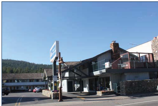
An existing lodging project