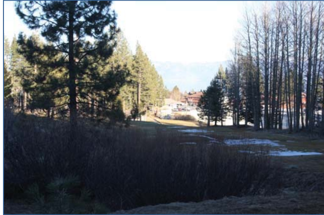
Tahoe City Golf Course

The Tahoe City Town Center boundary is modified to exclude about 3.4 acres at the Fairway Community Center and about 3.6 acres of restored SEZs along Highway 89 - and to include about 4.2 acres at the Tahoe City Golf Course clubhouse as a mixed use area subject to Special Planning Area requirements as outlined below. Areas excluded from the Town Center are primarily SEZ. Areas added are more suitable for development. The Kings Beach Town Center remains unchanged from the Regional Plan.