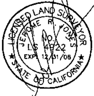
EXHIBIT 'B' KEMPER WOODS SEWER ANNEXATION

SEWER MAINTENANCE DISTRICT NO. 1 ANNEXATION NO. 132