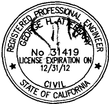
EXHIBIT "B" ABANDONMENT OF PUBLIC UTILITY EASEMENT A PORTION OF LOT 14, E MAPS 79, O.R.P.C. BEING A PORTION OF THE SECTION 2, T. 12 N., R. 8 E., M.D.M.

ATTEBERRY & ASSOCIATES P.O. BOX 5396 AUBURN, CA 95604-5396 (530) 888-1288