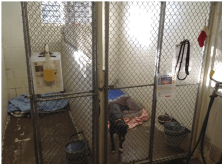
Kennels in the Tahoe Vista Animal Shelter are small and old.