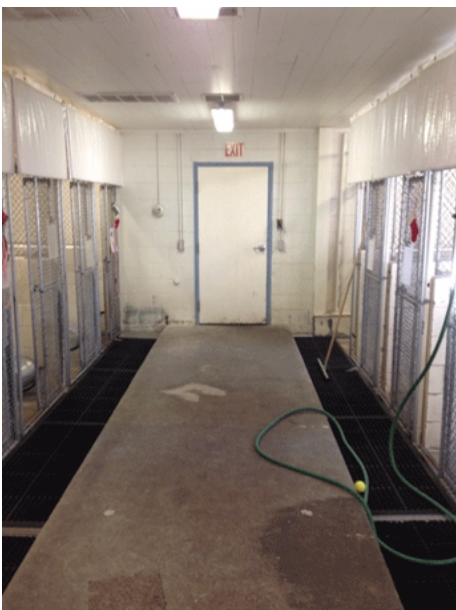
The porous floors in the Tahoe Vista Shelter are difficult to clean, trap odors and increases disease transmission.