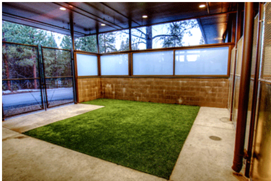
The Town of Truckee Shelter includes a covered animal play area.

If the Board approves the contract, the Tahoe Vista facility would no longer house animals but service for Placer County