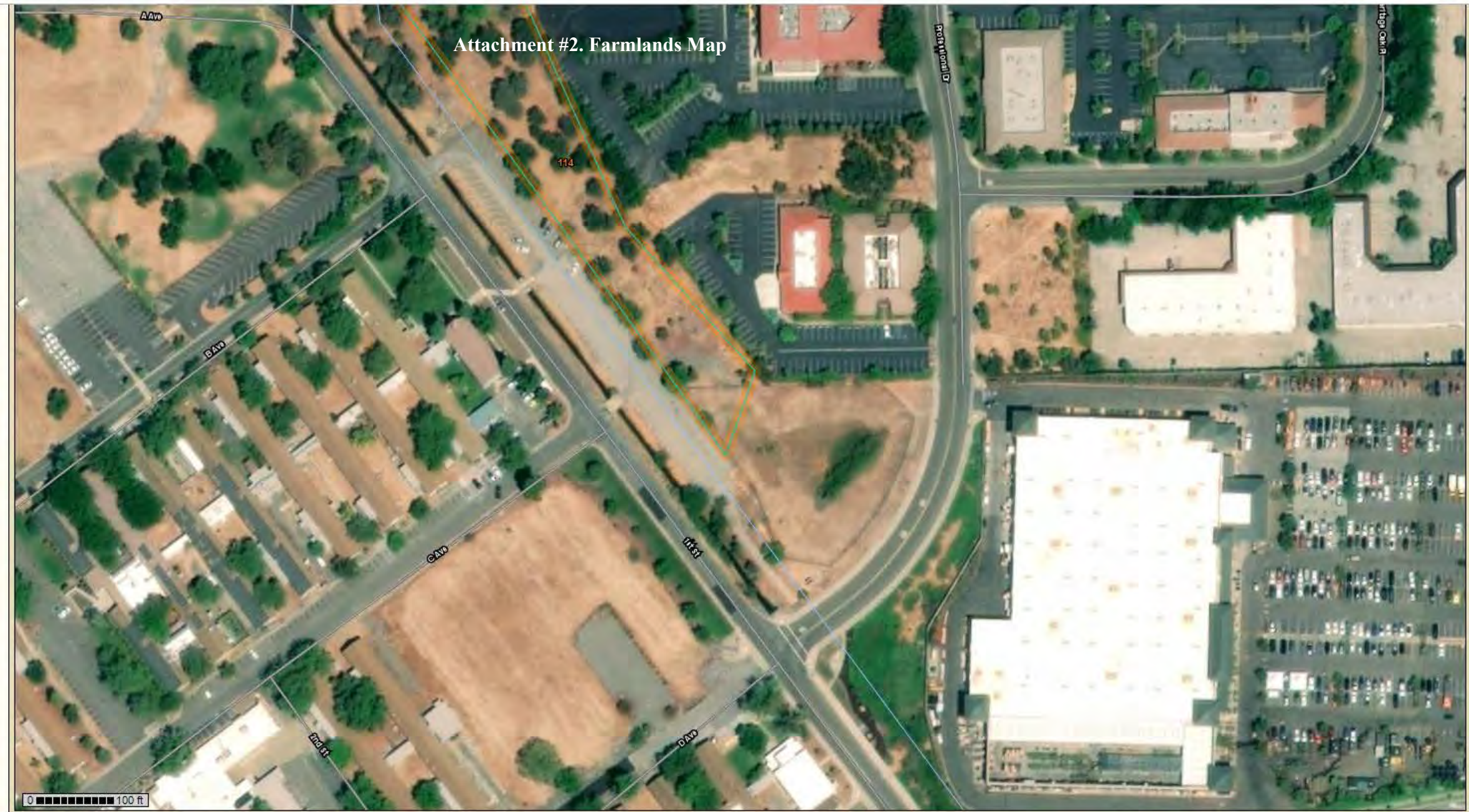
Attachment #2. Farmlands Map