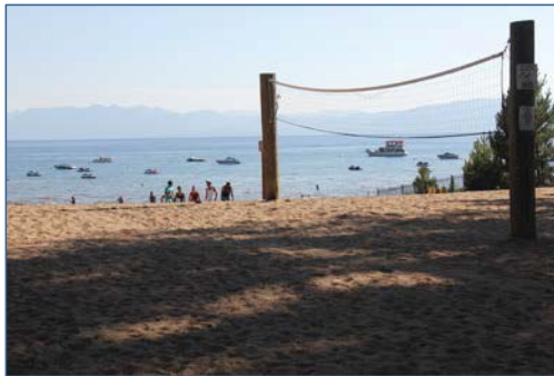
Beach activities in Kings Beach

In summer and fall, activity shifts to Lake Tahoe and the surrounding lakefront communities. Backcountry activities are increasingly popular in all seasons.