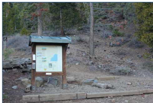
Tahoe Rim Trail - Tahoe City Trailhead

Federal and state agencies are primarily responsible for maintaining and improving backcountry areas and trails. Prominent trails in the Plan area include the Tahoe Rim Trail, Pacific Crest Trail, Rubicon Trail and local connections. Trailheads are located at the Fairway Community Center and 64-Acre Park in Tahoe City, Highlands Community Center in Dollar Hill, and on Forest Service lands in Blackwood Canyon, Ward Creek, and Brockway Summit.