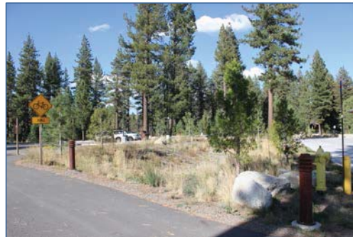
64 Acre Park and Trailhead

Several high quality bike and pedestrian paths are found in the Plan area. In recent years, trail use has increased and is now one of the most popular recreation activities in the Tahoe Basin. TCPUD reports annual usage in excess of 500,000 people on their multi-use bike trail along the west shore, through Tahoe City, and along the Truckee River.