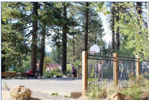
A park in Kings Beach

Policies support dispersed recreation activities by identifying areas where low-density recreational experiences are prioritized, such as undeveloped shorelines, wilderness, and other undeveloped and roadless areas.